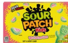
21516 AMERICAN SWEET & CANDY SOUR PATCH WATERMELON 12x99GR