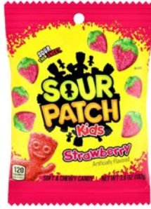
22829 AMERICAN SOUR PATCH BAG STRAWBERRY 12x101G