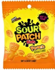
22834 AMERICAN SOUR PATCH BAG PEACH 12x101G