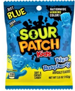
22835 AMERICAN SOUR PATCH BAG BLUE RASPBERRY XXX