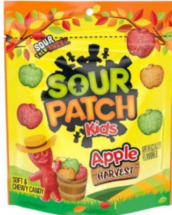
23833 AMERICAN SOUR PATCH KIDS APPLE HARVEST PEG BAGS XXX