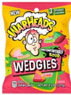
23831 WARHEADS WEDGIES PEG BAGS 12X99G