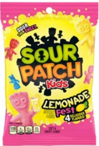
22831 AMERICAN SOUR PATCH BAG LEMONADE 12x101G