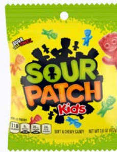
22830 AMERICAN SOUR PATCH CLASSIC 12x101G