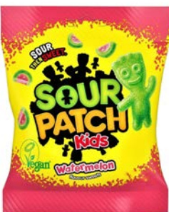
22837 AMERICAN SOUR PATCH BAG WATERMELON 12x101G