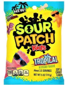
22833 AMERICAN SOUR PATCH BAG TROPICAL 12x101G